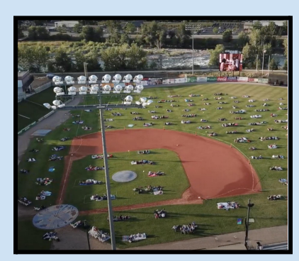
Superhero Movie Night