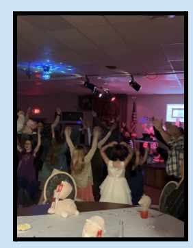
Annual Father Daughter Dance